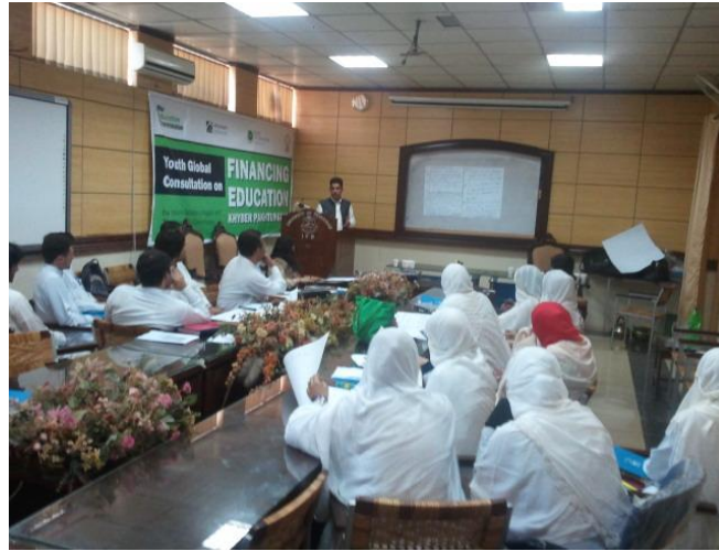
Students from IER, UoP presenting their group recommendations